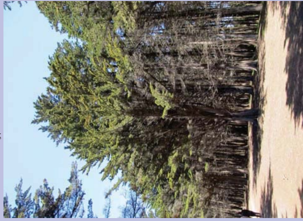
Good Live Crown Ratio, Good Form