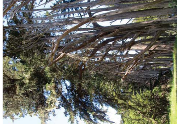
Heavy Lateral Limbs, Over Extended