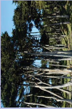
Well Maintained Cypresses