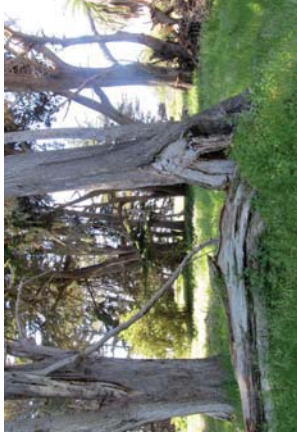
Failed Codominant Leader