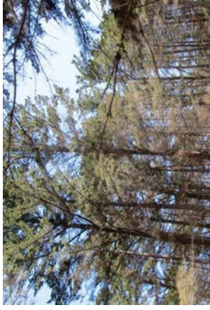
Poor Live Crown Ratio, Poor Trunk Taper