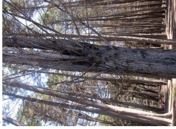
Poor Crotch Formation